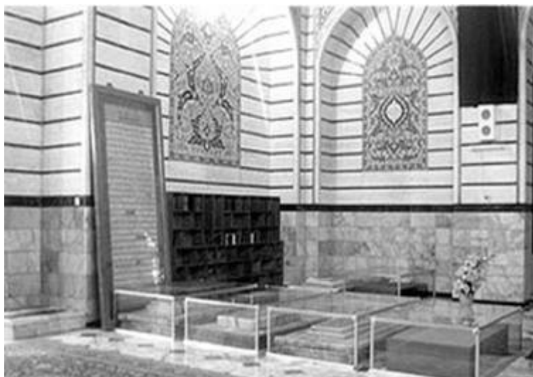
The Graves of Some Grand Ayatollahs in Masjid Bāqī Sar, in the Shrine of Lady Fatima Masuma (A) in the Shrine of Lady Fatima Masuma (A) in the Shrine of Lady Fatima Masuma (A)