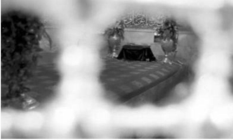
The Tomb of Lady Fatima Masuma (A)

From the tradition above, it would not be unjustified to assume that the two masked riders who appeared from nowhere, to take part in the burial ceremonies of Lady Fatima Masuma (A) were, in fact, Imam al-Ridā (A) and Imam al-Taqī (A).