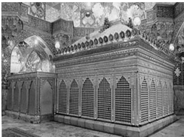
The Old Burial Chamber (Darh) of Lady Fatima Masuma (A)

In the year 1230 A.H, Fath Ali Shih Qajar, covered this steel grill with silver. This remained in place until it showed signs of deterioration and in the year 1280 A.H, a new chamber, using silver from the old one, as well as additional silver from the treasury, was erected, entirely replacing the old one.