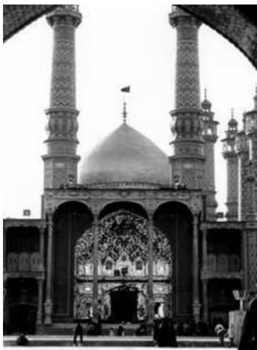
The Mirror Tiled Porch Entrance to the Shrine of Lady Fatima Masuma (A), from the New

Lady Fatima Masuma (A) is buried in Qum, Iran. Due to her blessed presence and patronage, the city has grown into a centre of Shi'a learning; a destination for thousands of Muslim students from over 80 countries.